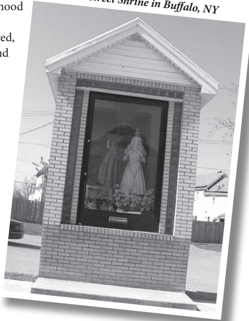
The Seneca Street Shrine in Buffalo, NY