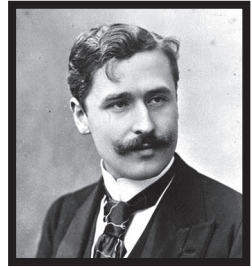
Georges Feydeau, writer of LE DINDON

Georges Feydeau was the master of the sex farce , entertaining fin-de-siècle audiences with his door slamming comedies and outrageous sense of humor. Born in 1862, he decided as a child to make a life in the theatre, scribbling plays when he should have been doing homework. By 30, he was not only a successful actor but also the author of competing smash hits on the Paris stage. One critic, who bemoaned that Feydeau was wasting his “truly remarkable talents” on a career devoted to silly vaudeville sex comedies remarked, “how can you win out against someone who makes you laugh so hard?”